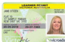
Victorian learner permit