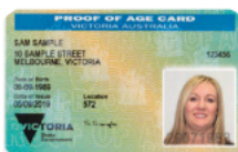
Proof of age card