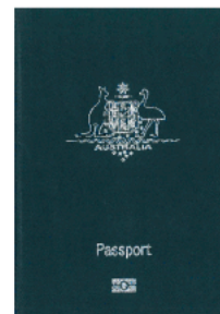
Australian or foreign passport