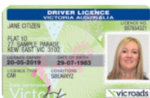
Australian driver licence